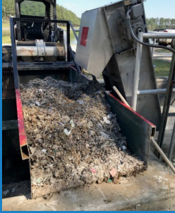
This is three days of screening at 1.5 MGD!!