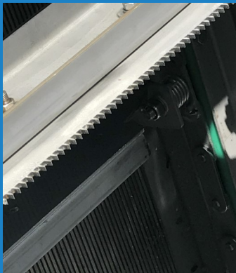
The teeth on the rake are very fine, but very strong, and keep the screen clean with no wear areas.