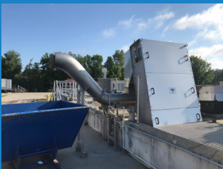
Installation at Kingsland, GA.