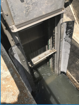
A 2mm, 2 MGD screen installed at Hazlehurst, Georgia.