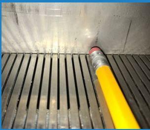
The secret sauce of the MBS is the reverse, triangular-shaped bars. They don't clog, have minimal headloss, and allow for shorter teeth that do not break!