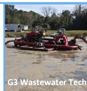
G3 Wastewater Tech